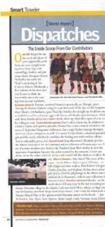
Nat Geo Traveler