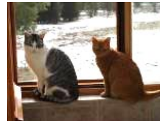
Upa & Dulce