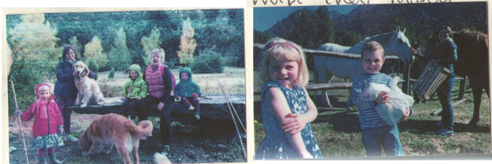
(The Brett family)